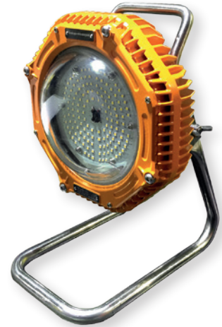
Optional Floodlight Stand