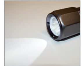
Rear Torch Light