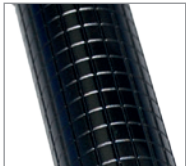
High Strength Aluminium housing