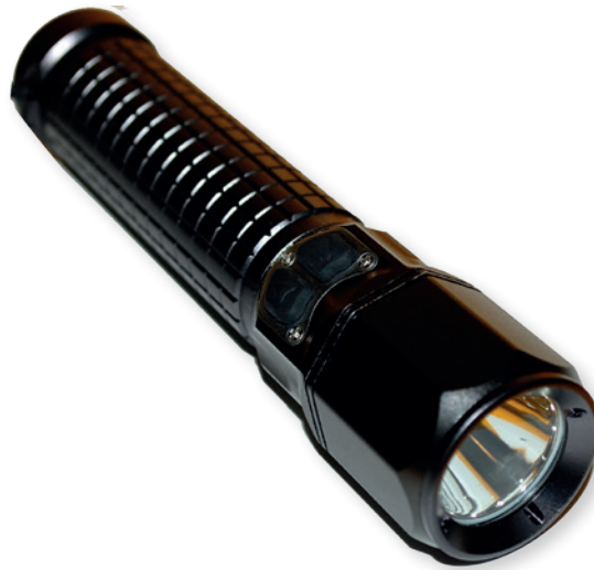
Front Spot Light