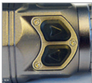
Simple Switch Operation